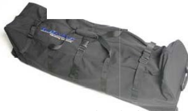
54 x 14 x 14 Wheeled Carry Bag for Easy Transport